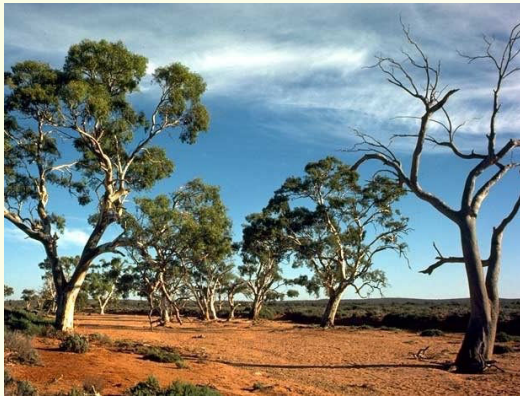
Gardening in a Drying Landscape

These have built on the experience of the previous year and have been promoted directly to the public. Two were held with a total attendance was 116.