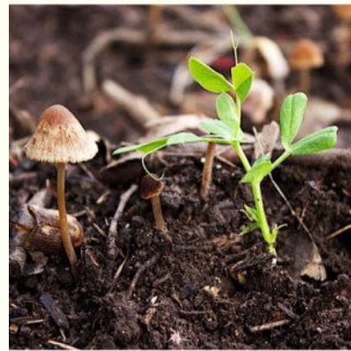
Living Soils and the New NPK: Nutrients, Physical Structure, Key Biology